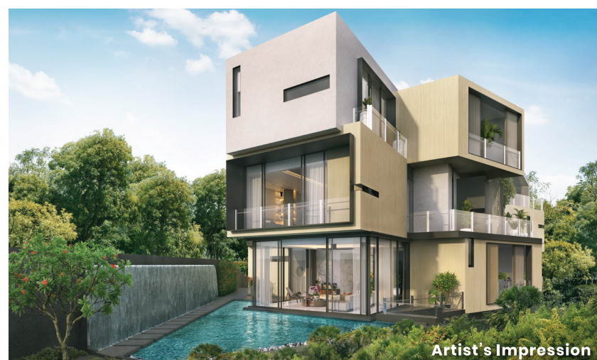
VILLAS @ GREENBANK PARK