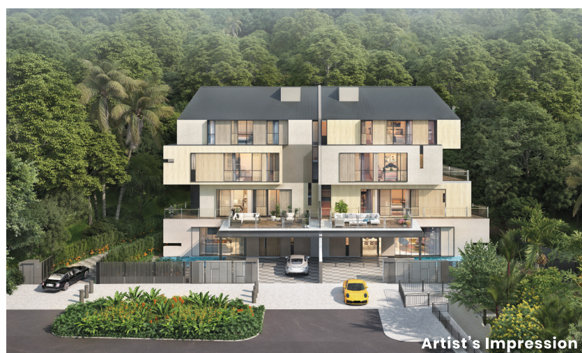
VILLAS @ GREENBANK PARK